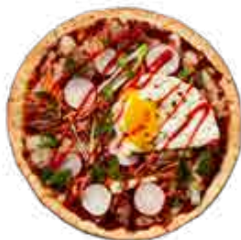
CHEEZY GLUTEN-FREE 10" (2 BAGS OF 12; 24 CT) - 020041-0269 12" (2 BAGS OF 12; 24 CT) - 120041-0269

IT'S HERE! INQUIRE ABOUT OUR NUT-BASED CRUSTS