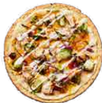
CHEEZY BROCCOLI GLUTEN-FREE 10" (2 BAGS OF 12; 24 CT) - 020044-0269 12" (2 BAGS OF 12; 24 CT) - 120044-0269