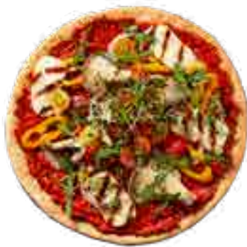
GLUTEN-FREE CAULIFLOWER 10" (2 BAGS OF 12; 24 CT) - 020040-0269 12" (2 BAGS OF 12; 24 CT) - 120040-0269