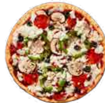
CHEEZY CAULIFLOWER GLUTEN-FREE 10" (2 BAGS OF 12; 24 CT) - 020042-0269 12" (2 BAGS OF 12; 24 CT) - 120042-0269