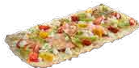
CAULIFLOWER HERB FLATBREAD 4" X 12" (3 BAGS OF 20; 60 CT) - 020412-0269