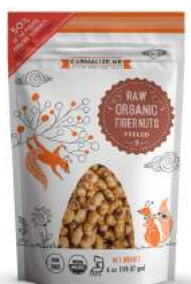
6-oz (170.1 g)