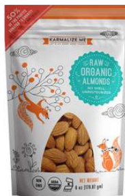
6-oz (170.1 g)