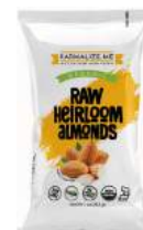
1-oz (28.4 g)