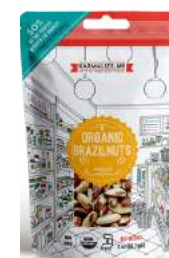
2-oz (56.7 g)