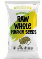
1-oz (28.4 g)