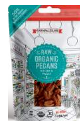
2-oz (56.7 g)