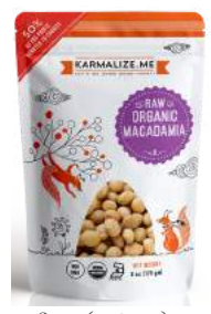
6-oz (170.1 g)