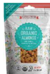
2-oz (56.7 g)