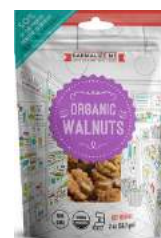
2-oz (56.7 g)