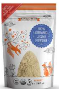
6-oz (170.1 g)