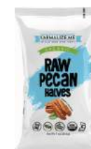
1-oz (28.4 g)