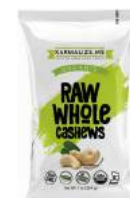
1-oz (28.4 g)