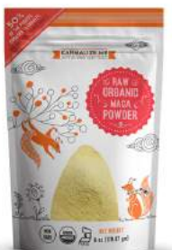
6-oz (170.1 g)