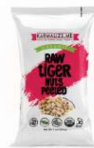
1-oz (28.4 g)