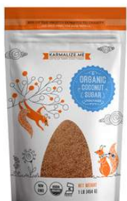
1-lb (454 g)