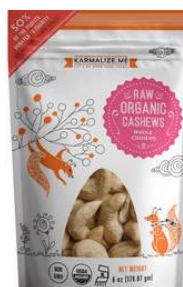
6-oz (170.1 g)