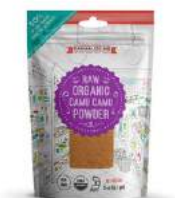
2-oz (56.8 g)