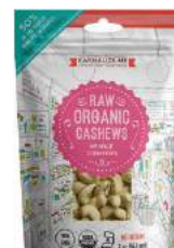
2-oz (56.7 g)