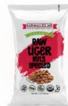
1-oz (28.4 g)