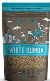
1-lb (454 g)