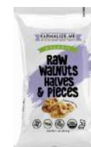
1-oz (28.4 g)