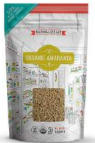
1-lb (454 g)