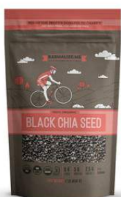
1-lb (454 g)