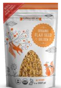
6-oz (170.1 g)