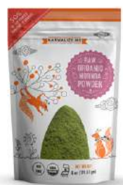
6-oz (170.1 g)