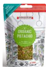
2-oz (56.7 g)