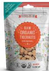
2-oz (56.7 g)