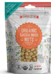
2-oz (56.7 g)