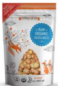
6-oz (170.1 g)