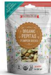
2-oz (56.7 g)