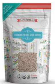
1-lb (454 g)