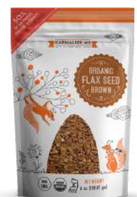
6-oz (170.1 g)