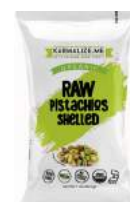
1-oz (28.4 g)