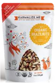
6-oz (170.1 g)