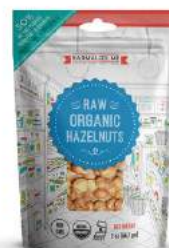
2-oz (56.7 g)