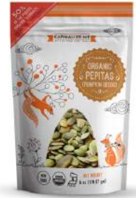
6-oz (170.1 g)