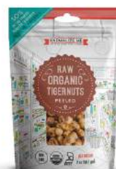
2-oz (56.7 g)