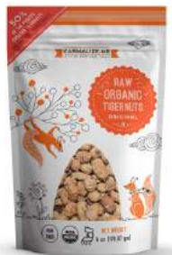
6-oz (170.1 g)