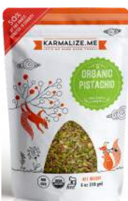
6-oz (170.1 g)