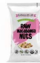
1-oz (28.4 g)