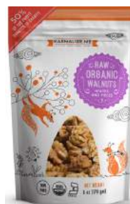
6-oz (170.1 g)