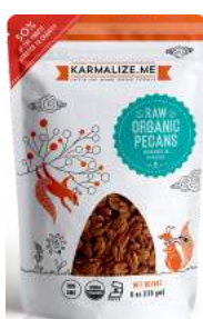
6-oz (170.1 g)