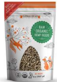
6-oz (170.1 g)