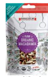
2-oz (56.7 g)