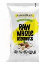
1-oz (28.4 g)