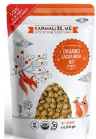
6-oz (170.1 g)